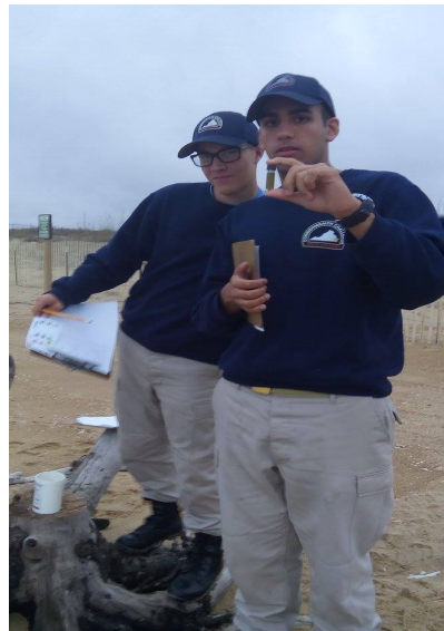
Science Club members taking samples of ocean water for analysis.