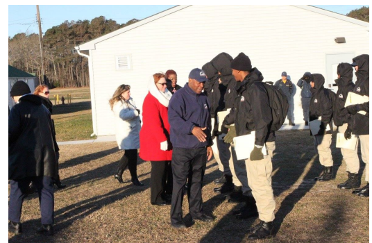
Staff congratulate Silver and Gold Phase Cadets on their achievements.