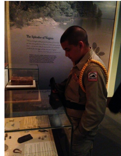
A Gold Phase Cadet views an exhibit at Historic Jamestowne.

Cadets also receive a gold rope, in order to show their status on their uniforms.