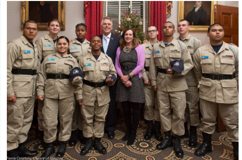
Commonwealth Challenge Cadets meet with Virginia Governor Terry McAuliffe and the First Lady of Virginia.

After graduating from the residential phase on March 5th, Class 44 will begin the twelve-month post-residential phase where each Cadet will continue to work with both their ChalleNGe career counselor and their mentor. During this phase,