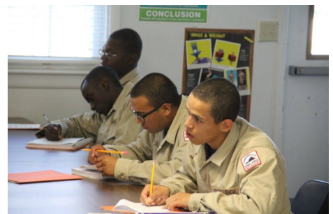
Cadets intensely focus in class, especially as it gets closer to testing time.