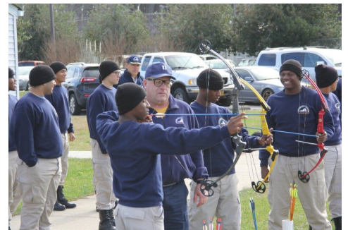
Cadets get to take part in many sports and activities, including Archery.