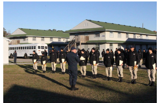
Gold Phase Cadets stand at the position of attention (POA) with gold ropes in hand.