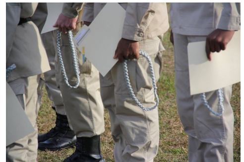
Cadets hold ropes to show their status as Silver Phase Cadets.