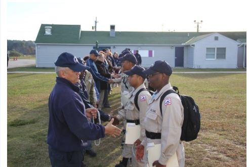
Commonwealth Challenge staff congratulate Silver Phase Cadets on their progress.

Cadets also receive a silver rope, in order to show their status on their uniforms. Silver Phase Cadets are eligible to work towards Gold Phase, which allows for even more privileges. Gold Phase begins in January 2016.