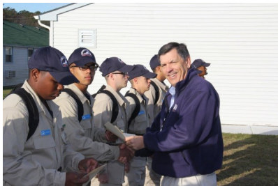
Cadet Orange, Silver Phase Virginia Beach, Va. Green Run High School